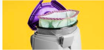
Cleaning for Health