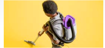
Ease of Use