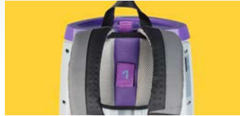
Comfort + Ergonomics