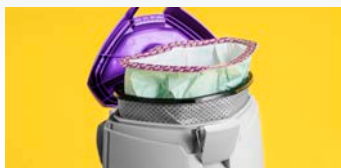
Cleaning for Health