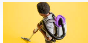
Ease of Use