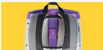
Comfort + Ergonomics